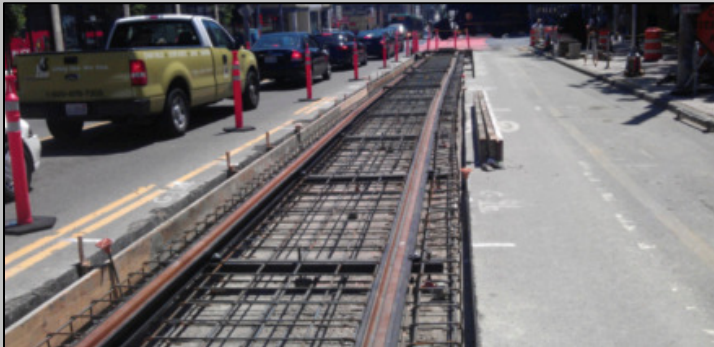
Rail installed and ready for concrete placement